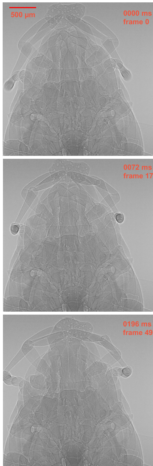
Fig. 1. In vivo image sequence of the feeding cockroach Periplaneta americana . 250 FPS data acquisition speed, ~5.5 μm effective pixel size.

In Fig. 1 frames of a movie consisting of several thousand images are shown. The data acquisition speed is 250 FPS at an effective pixel size of approx. 5.5 μm. The image quality we achieved is high enough to perform a semi-automatic 2D image analysis of the acquired radiographic sequences [3].